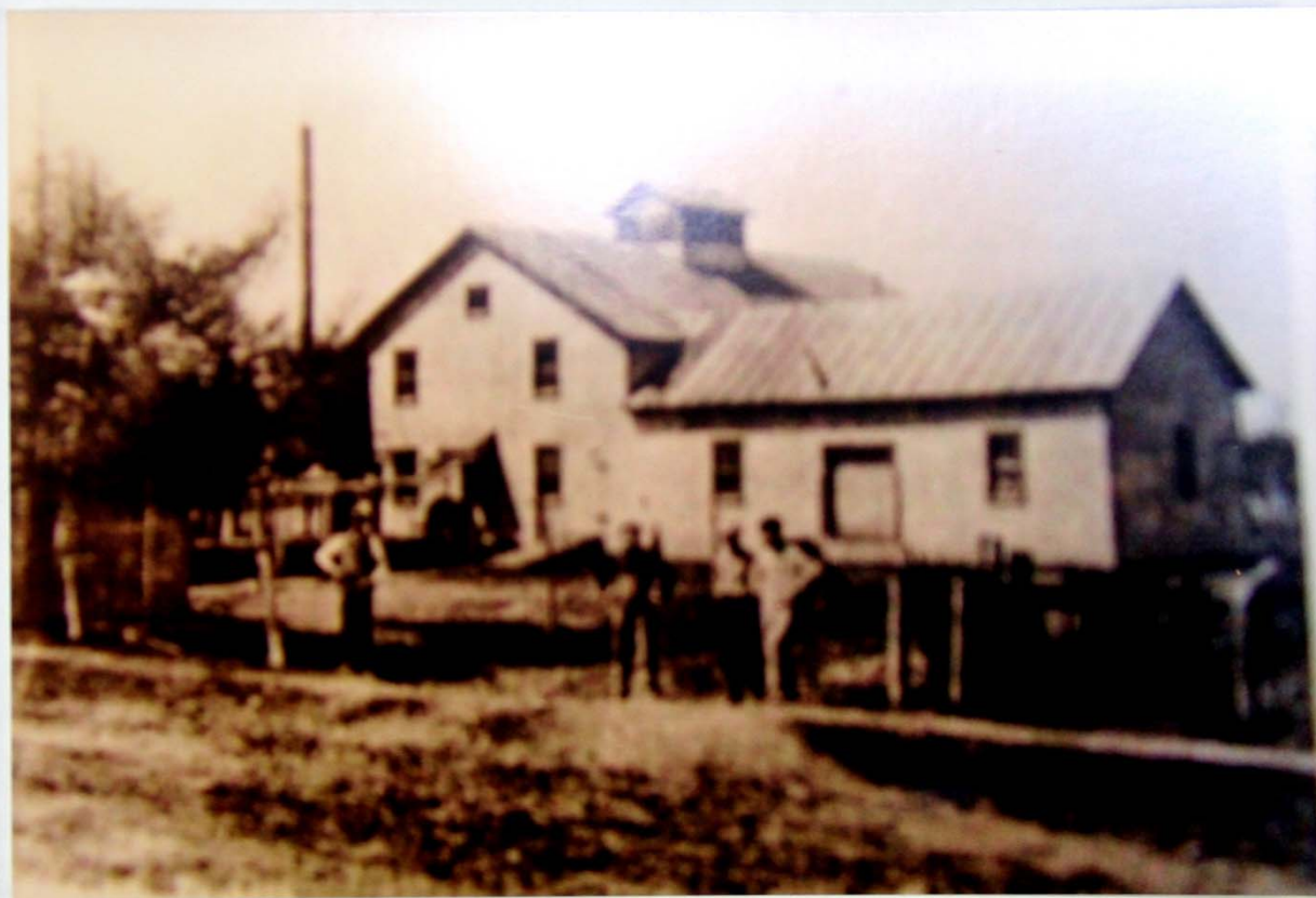
Fabius Canning Factory